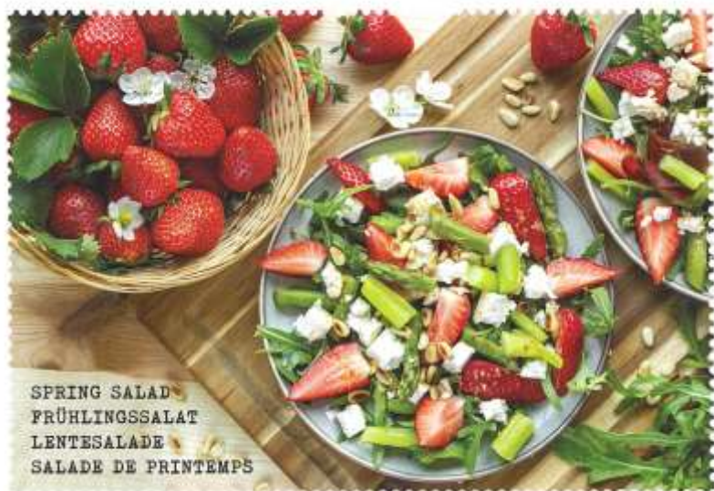
SPRING SALAD FRÜHLINGSSALAT LENTESALADE SALADE DE PRINTEMPS