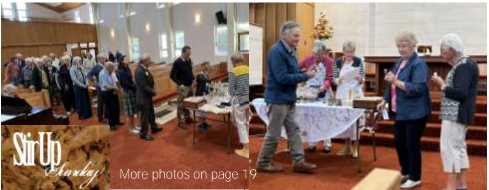
More photos on page 19