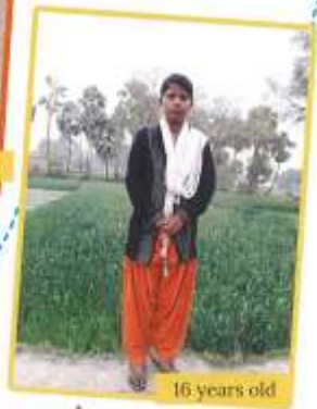
16 years old