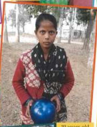
19 years old