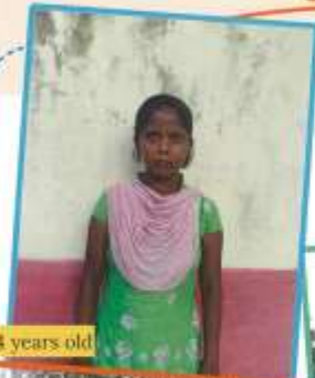
14 years old