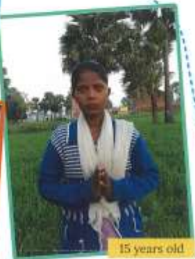
15 years old