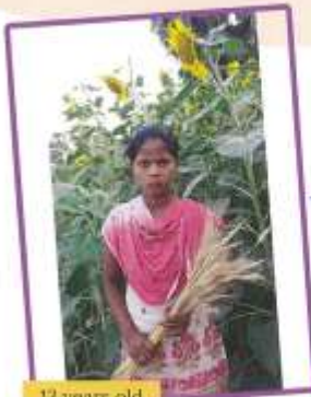
13 years old