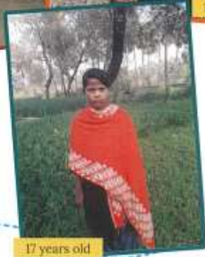
17 years old