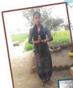
18 years old