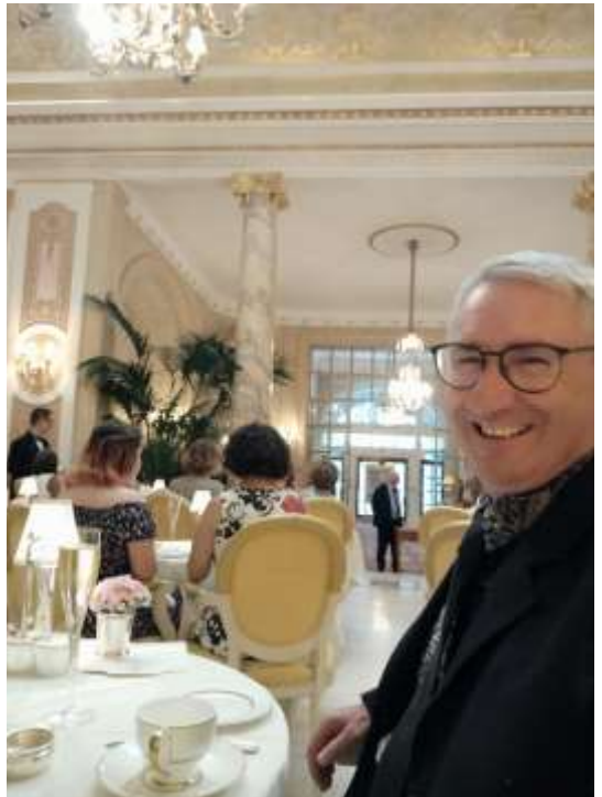
High tea at the Ritz for my Birthday.

We thoroughly enjoyed our time away with so many wonderful experiences, meeting interesting people and living a carefree life for a time. But, as they say, there is no place like home and we are truly grateful to be back where we belong, among family and friends.