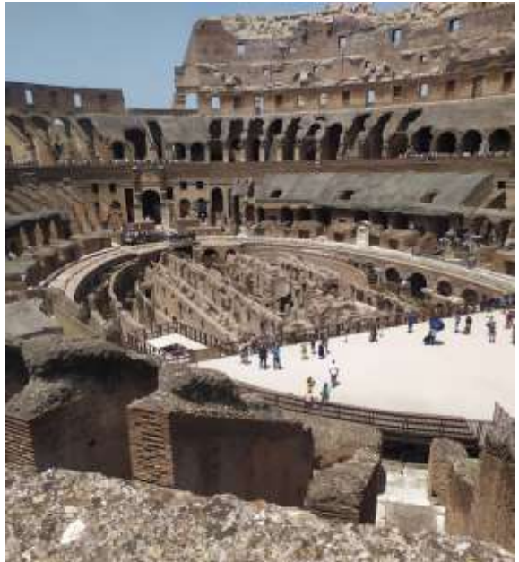
The Colosseum, Rome

Catherine's. We had a night in Hollywood which sounds glamorous but actually had a disturbing number of homeless people living on the street outside our hotel.