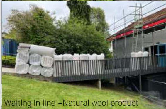
Waiting in line –Natural wool product

While the roofing damage was an unexpected disaster, there is often a silver lining in these things. We have a one-time opportunity to insulate the main hall area and we are proceeding with this, working in with the roofers and insulation specialists. It is a natural wool-based product, cleaner and longer lasting than conventional pink batts.