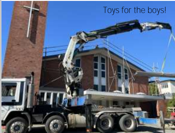
Toys for the boys!

Work is now in full swing on the hall, and the team should be well advanced by the time you read this. It will take longer than the church because the flat surround area is to be replaced, whereas on the church this iron (around the side porch and frontage) was older and heavier and stood up