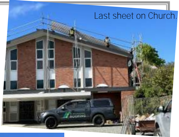
Last sheet on Church.

The re-roofing of Trinity church and hall is going well. The church is finished with the scaffolding due to be removed this week. We also renewed three of the glass panels in the Skylight over the apse which were also damaged by the giant hailstones of the November 2019 storm.