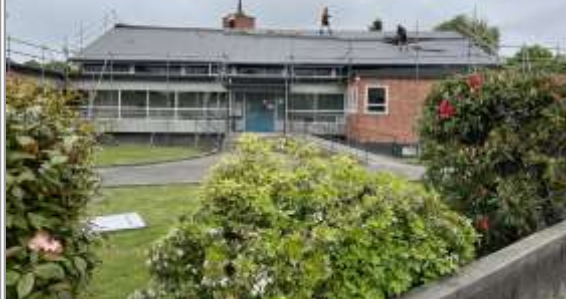
Starting on the hall.