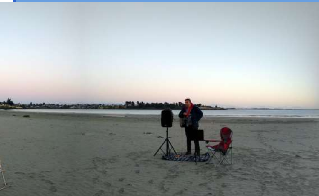
Photo from Easter Service at Caroline Bay back in 2018

For details of Easter and other services. see pages 6 & 12