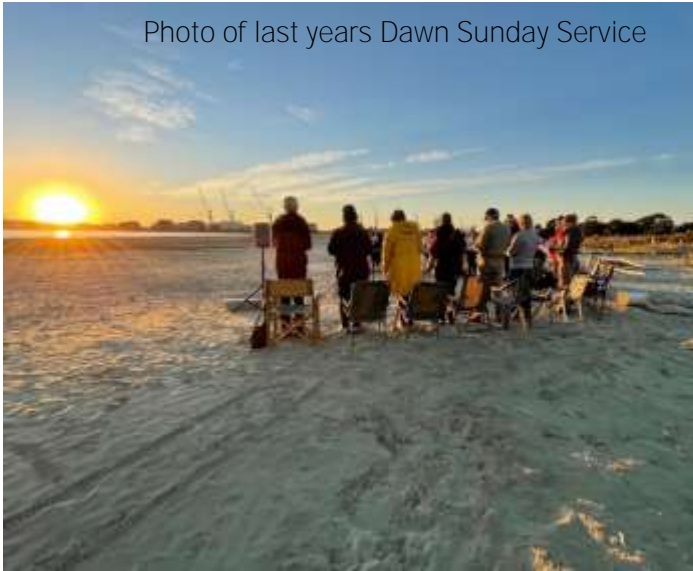
Photo of last years Dawn Sunday Service