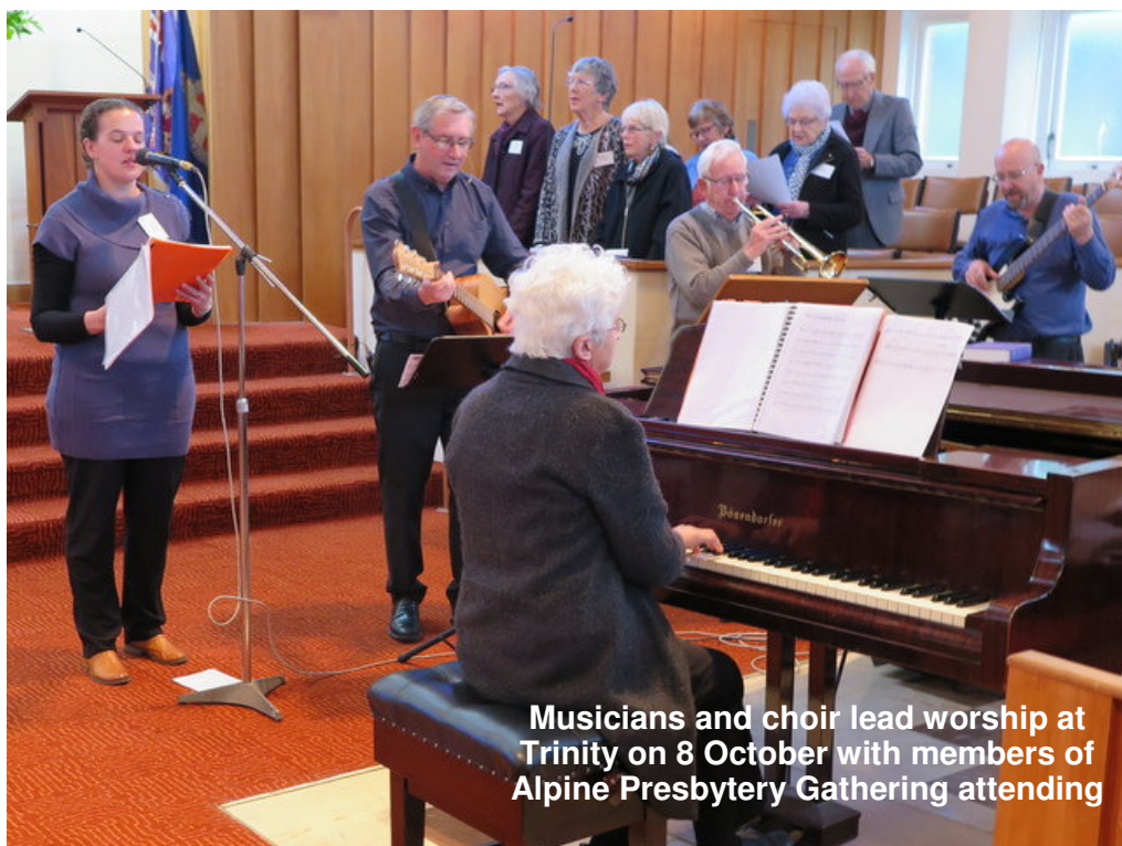
Musicians and choir lead worship at Trinity on 8 October with members of Alpine Presbytery Gathering attending